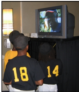
Team members who use Sampson Park enjoy time at the "Make A Smile" donor recognition reception.

One of the most important aspects of any professional conference is the networking potential. Building professional relationships and new connections with correctional practitioners throughout the nation is invaluable to continued success in this business. New Orleans was a great venue to build and reinforce those connections.